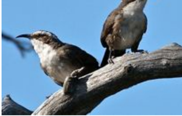
WHITE-BROWED BABBLERS

From Duffy's lagoon, head south, then east on Duggans Road. Continue past Lousy Road and Toorak Road until you reach a picnic ground with toilets alongside a bridge over The Edward. Birds often observed here include White-browed Babbler, White-browed Scrubwren and Dusky Woodswallow. From here, follow the Tocumwal Road south back to the Mathoura-Picnic Point Road. You may wish to stop at Reed Beds.