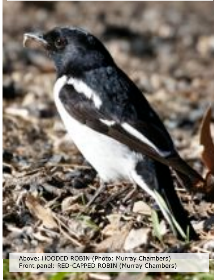
Above: HOODED ROBIN Front panel: RED-CAPPED ROBIN

For more information, email echuca@birdlife.org.au